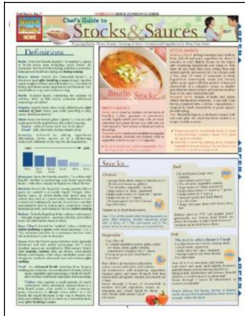
Filesize: 4.06 MB