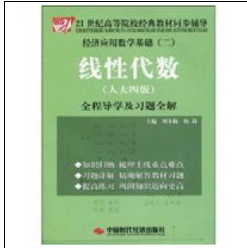
Filesize: 4.4 MB