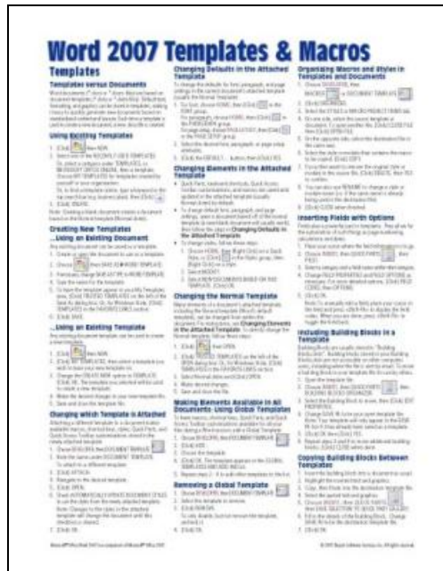
Filesize: 7.52 MB